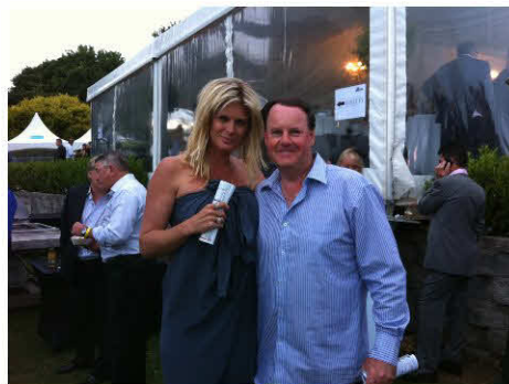
Lucky me! Pictured with Rachel Hunter at this year's Karaka Million race day at Ellerslie

P O Box 3069 Wheelers Hill Vic 3150 Phone: 03 9795 9111 1800 632 201 Mobile: 0408 127 459 E-mail: uniteds@bigpond.net.au Web: www.unitedsyndications.com.au