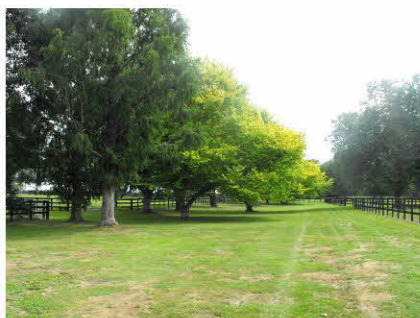
Beautiful Waikato stud