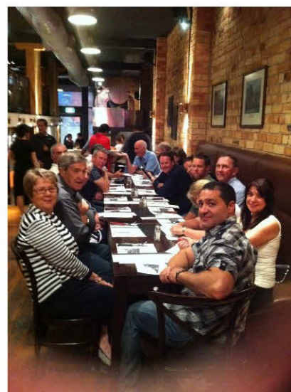
The 2011 NZ touring party at the Angus Steakhouse