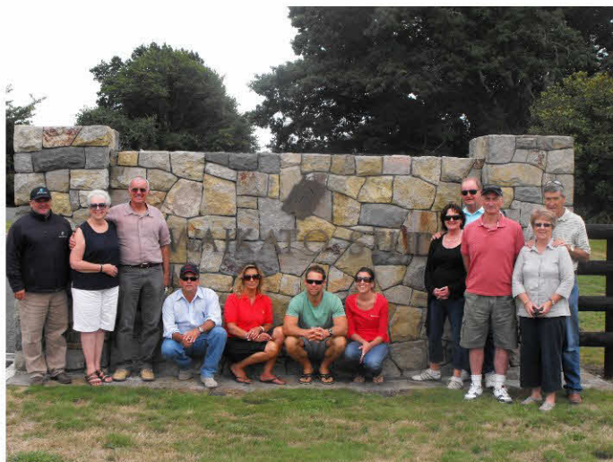
The 2011 Waikato Stud tour group