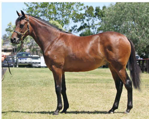
The High Chaparral/Clarens colt purchased at the 2011 NZ Premier sales for $100,000

The tour also included dining at some of Auckland's finer restaurants down at the viaduct area, as well as the Karaka Million race day at Ellerslie which included free entrance into the New Zealand Bloodstock Corporate marquee which included